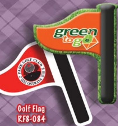
Golf Flag RF8-084